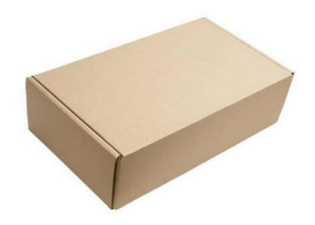
1pcs packing box size:175 *130 *9mm 12pcs in 1 outer Carton box: size: 190X400X380mm G.W:9.4KG